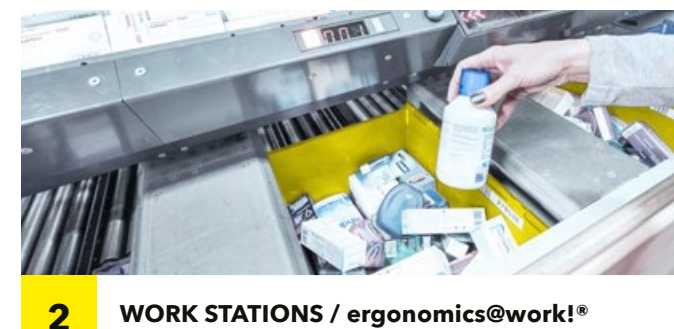
WORK STATIONS / ergonomics@work!®