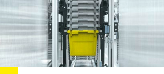
PAPER AND BIN HANDLING