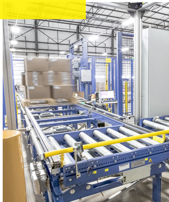
Pallet conveying system

SSI SCHAEFER adapted a solution that is personalized for the pharmaceutical industry. The concept is future-proof, making it scalable with DSV Healthcare business growth and expansion plans. The solution allows for the support of full pallet, case and single piece picking operations and is able to process approximately 30,000 orders lines per day. The systems installed in Johannesburg South Africa were the