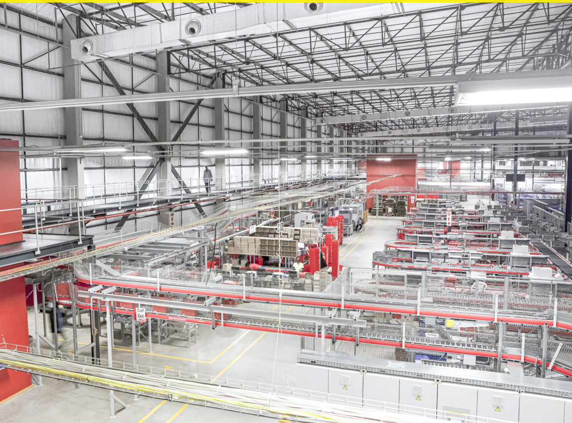
DSV Healthcare Facility