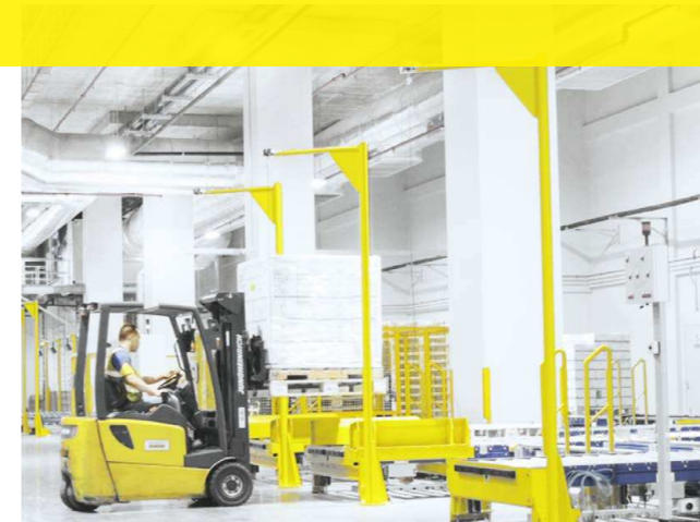
In the ramp-up warehouse, material flow starts with pallet conveyors

Watch the fully automated rack clad facility in action. https://youtu.be/c_ijuK_WHMQ