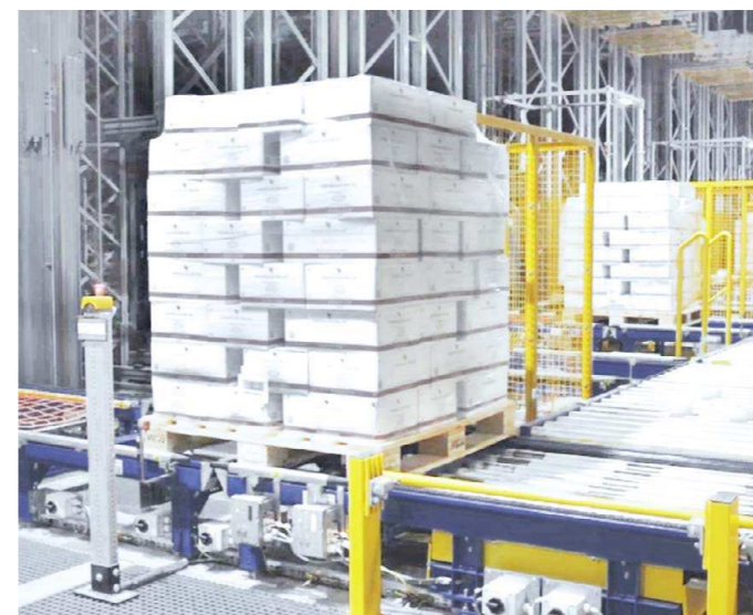
Seamless integration of SSI Exyz SRMs, conveying systems and software

including the warehouse. By combining the latest technologies, equipment, and innovative solutions, the YCH Group can continue to set new standards for supply chain excellence from the leading logistics hub in Singapore and beyond.