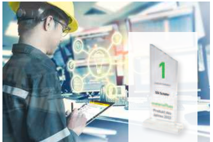
Awarded "Product of the Year 2022" in the Logistics Software category

The comprehensive maintenance and repair history is available around the clock at the press of a button, enabling forward-looking maintenance planning. CMMS optimizes and documents the maintenance activities. During this process, it significantly enhances the maintenance efficiency and safeguards the availability of your system.